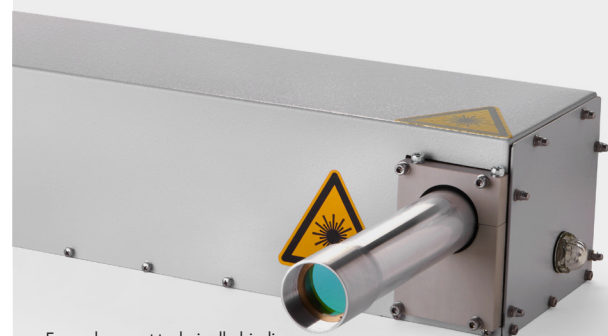
Exemplary, not technically binding

Special features: Detector head with CO 2 laser (laser class 4, NOHD 1.8 m, MTBF 20,000 h) with water cooling (closed circuit), infrared detector with an integrated cooler and infrared optics