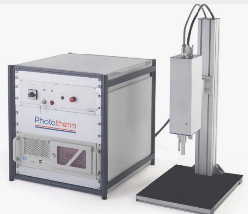
Exemplary, not technically binding